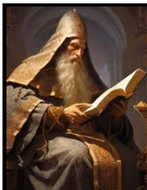
SAINT CYRIL OF ALEXANDRIA JUNE 27