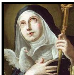
SAINT SCHOLASTICA FEBRUARY 10