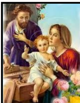
THE HOLY FAMILY OF JESUS, MARY AND JOSEPH DECEMBER 31