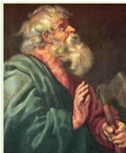
SAINT MATTHEW, APOSTLE SEPTEMBER 21

Our first "family Mass" of the new pastoral year will be celebrated at 12 Noon NEXT Sunday, September 24. Families from our 7th Grade Academy and Religious Ed classes are encouraged to attend. Our Youth Choir will sing, and other young people will serve in various ministries. All are welcome!