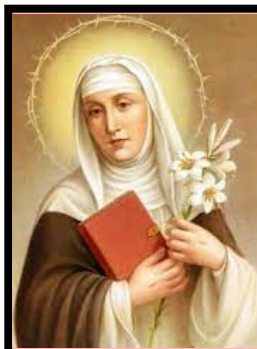
SAINT CATHERINE OF SIENA APRIL 29