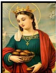
SAINT ELIZABETH OF HUNGARY NOVEMBER 17