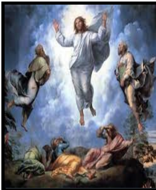
THE TRANSFIGURATION OF THE LORD AUGUST 6